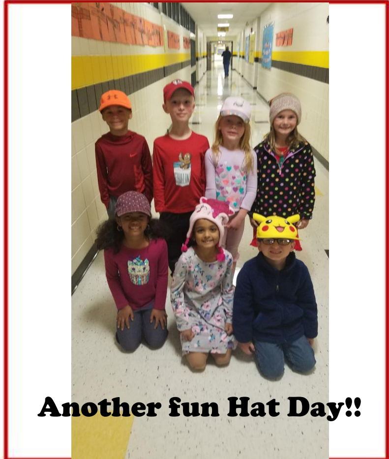
Another fun Hat Day!!